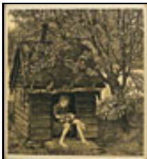
The doll's house