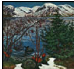
Bird on a rock