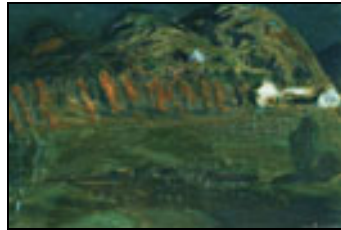
Sheaves of corn, pastel