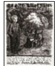
Illustration in novel of Bj.Bjørnson