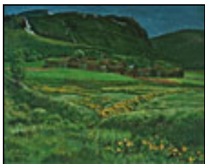
A night in June - and an old country courtyard in Western Norway