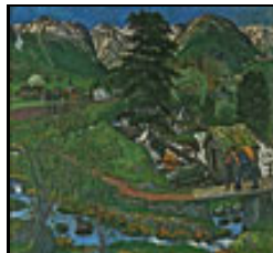
Walking to the mill - and a country courtyard in Jølster