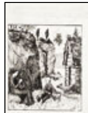
Illustration in novel of Bj.Bjørnson