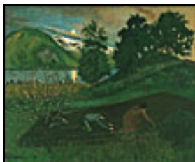
A spring night in the garden