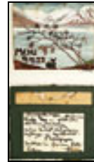
Menu - 9 July 1922, water-colour