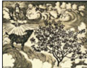
The goat that went to Heaven