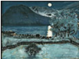
Moon in May, winter version