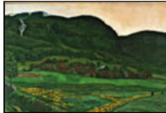
A clear night in June