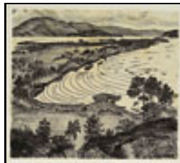
The Svanøy Bay