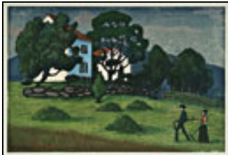
Home from work