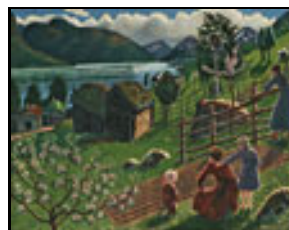
Weather promising a good crop at Sandalstrand