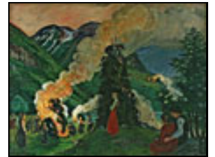
The great bonfire