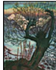
Spring night and old sallowman