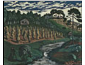
Large sheaves of corn