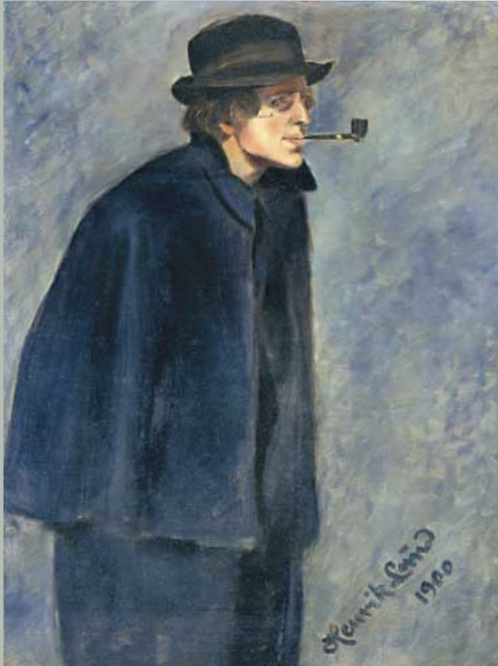
Portrait of Nikolai Astrup, painted by Henrik Lund, 1900.