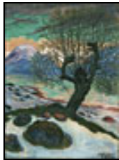
Daybreak in March