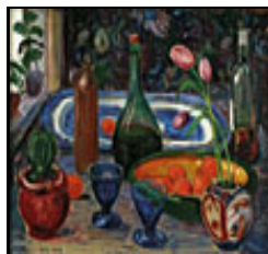
Still life, sketch