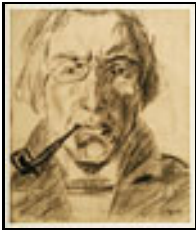
Portrait of the artist with pipe