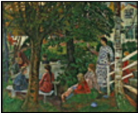
Birthday party in the garden