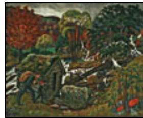
Walking to the old mill